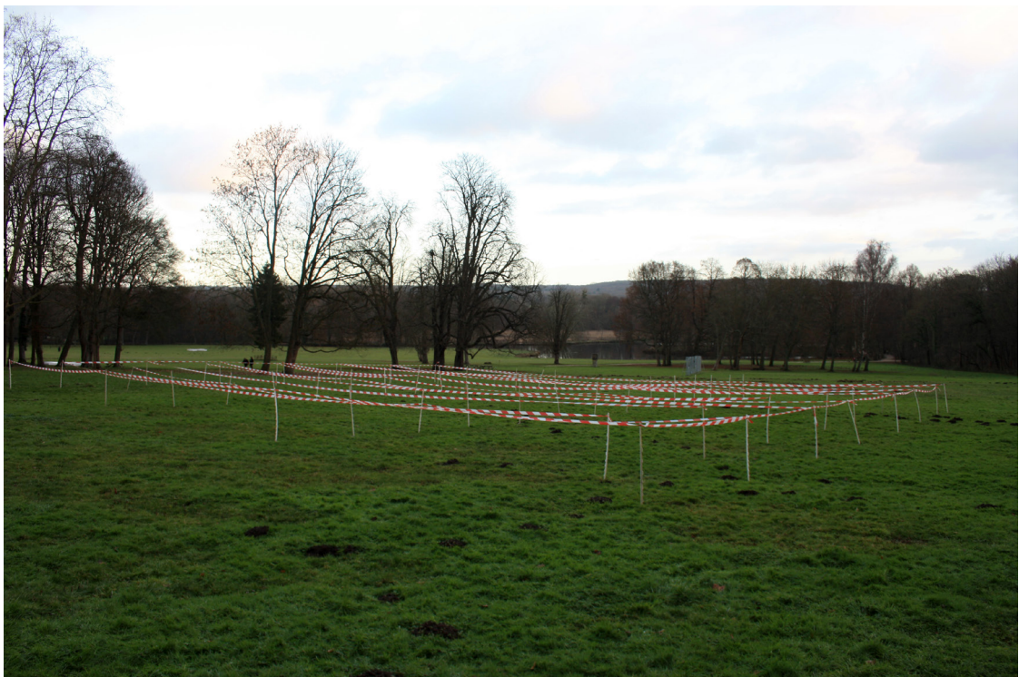
After Nature / 2010 / Protective tape + stakes / 30 x 30 x 1 m

At Chamarande contemporary art center, and in connection with Pascal Rivet's exhibition 'Concession' and his exploration of the link between human beings and their work tools, I suggest walking the course of a tractor ploughing a field.