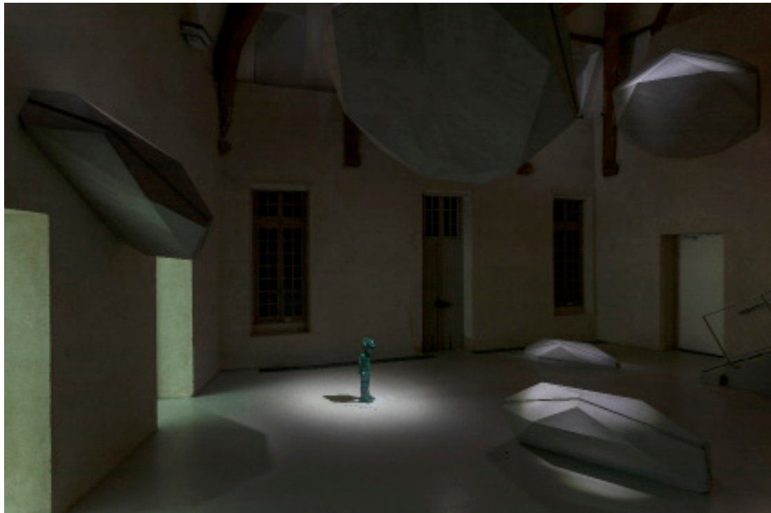
Drifting Meteors / 2020 / Installation of 5 modules / variable dimensions Contemporary Art Center La Maréchalerie

Concrete gardeners, in the style of street furniture of the 60s and typical of the development of cities and suburbs, cross the exhibition space of La Maréchalerie. Here the gardeners do not contain plants and their primary role of beautifying the city disappears. They are monolithic, sliding in space like drifting meteorites, unidentified flying objects coming to ground on earth. It mixes with a feeling of weightlessness and immateriality, a disturbing futuristic vision.