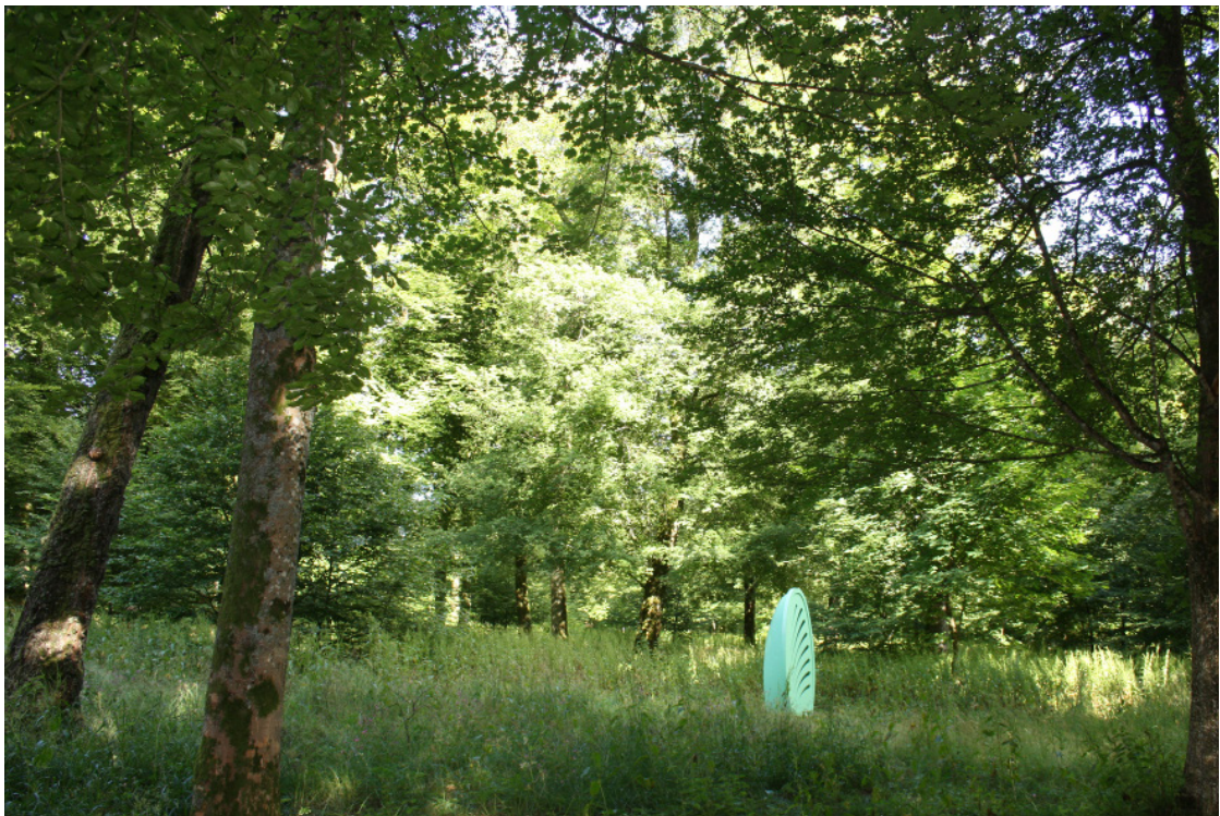
Plant freshness / 2012 / Resin polyester / 250 x 130 x 60 cm Stadspark Aals, BE / CACLB, Belgian Luxembourg