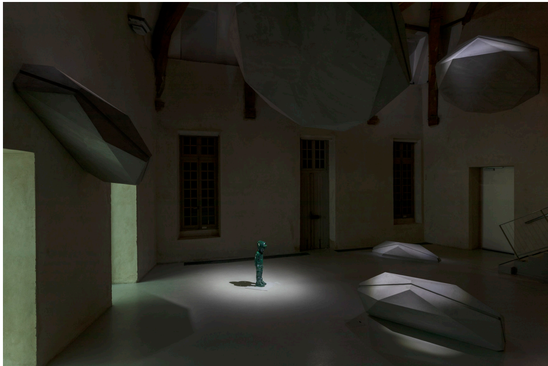
Drifting Meteors / 2020 / Installation of 5 modules / variable dimensions Contemporary Art Center La Maréchalerie

Concrete gardeners, in the style of street furniture of the 60s and typical of the development of cities and suburbs, cross the exhibition space of La Maréchalerie. Here the gardeners do not contain plants and their primary role of beautifying the city disappears. They are monolithic, sliding in space like drifting meteorites, unidentified flying objects coming to ground on earth. It mixes with a feeling of weightlessness and immateriality, a disturbing futuristic vision.