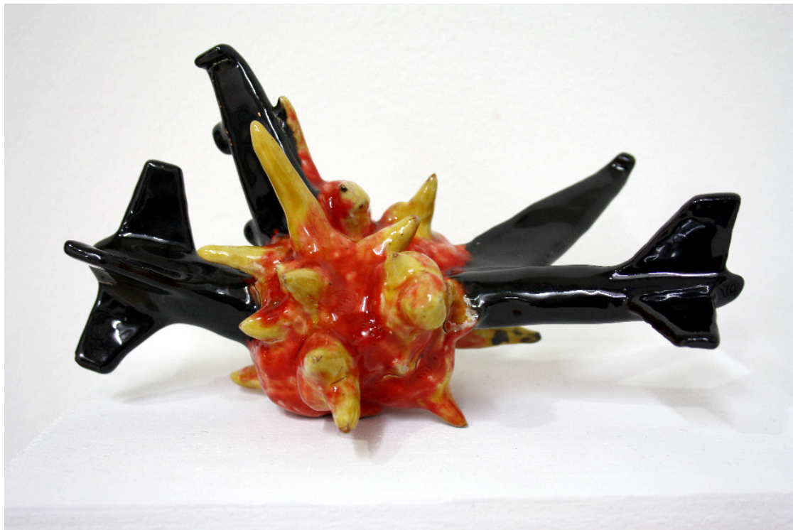
Small middle-class explosion / 2012 / Enamelled ceramics / 19 x 14 cm / 14 x 9 cm

Tiny explosions are modeled after pictures from TV or computer screens. These are home explosions, tamed, domesticated explosions. Violence takes a lower middle class shine.