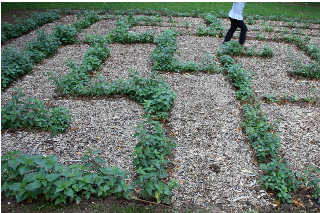
Nettle Labyrinth / 2010 / Nettles + wood shavings / 800 x 800 cm

A labyrinth composed of nettles is settled in a public park. The nettle plant is public space enemy number one. The labyrinth disciplines, masters it to give it at last control of the game.