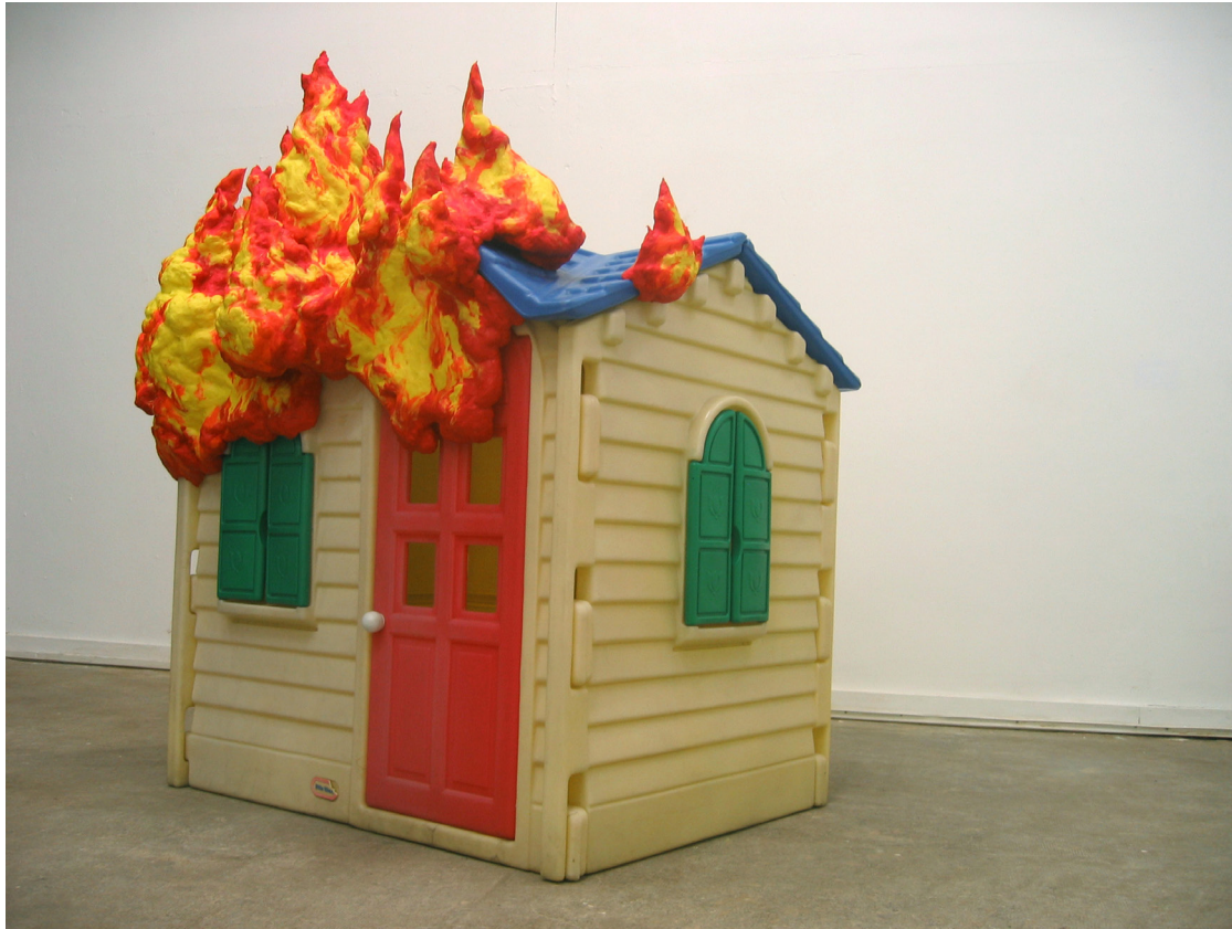
Games / 2006 / Plastic playhouse + play dough / 180 x 160 x 130 cm

Games is an outdoor plastic playhouse, covered in flames made out of modelling clay. Here fire can be controlled, the awareness of danger is virtual. Games conjures up our fascination for virtual games. Games which are not immediately dangerous.