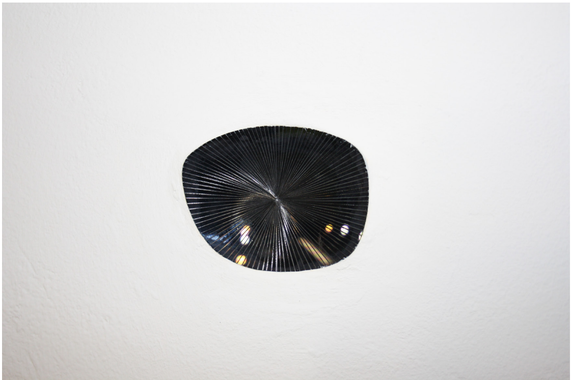
Black hole / 2015 / Curved sunglasses / 5 x 4 cm

Recessed into the wall a carved sunglasses in which we can see circular signs like infinite.