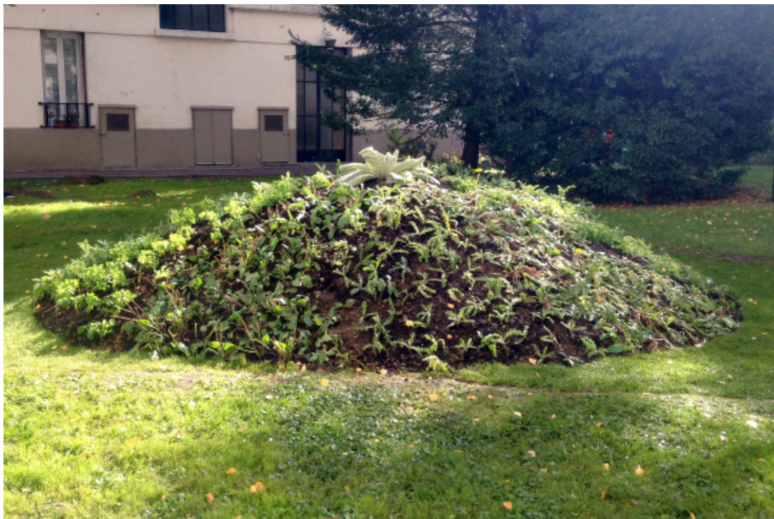
Replicant / 2017 / Weeds / 4 x 4 m

Replicant is the perfect replica of a floral composition settle in the gardens of Versailles, moved in social housing in Paris. The sophisticated composition is strictly the same as the heirs of Le Nôtre, but the flowers have been replaced by weeds: dandelions, thistles, nettles are meticulously arranged on the mound. Replicant looks like a flying saucer and borrows from science fiction the futuristic idea of displacement both in the layers of space-time and social classes.