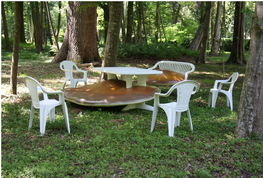
Hepatica fistulina #2 / 2010 / garden's furniture + synthetic wood paints / Variable dimension