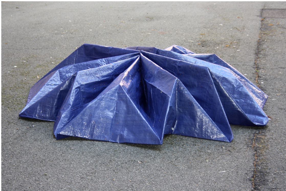
Guests / 2017 / Series of four photos / 75 x 50 cm

Guests # 1, # 2, # 3, # 4, are pictures of ephemeral installations with blues plastics tarps. These tarps are used in the construction of shelters wich are multiplying in the urban landscape. Folded like napkins in the shape of lotus flowers or lilies, these imposing origamis are proposals of structured forms, like small individual architectures. They redouble the gesture of migrants who grow shelters as plants grow.