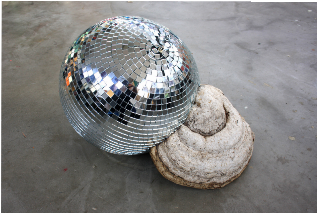
Big bang / 2012 / Bowl with facet + Mushroom of stump / 50 x 30 cm

Big-bang is a disco ball on which a mushroom has grown. Such natural excrescence on an artificial objects creates or results from chaos.