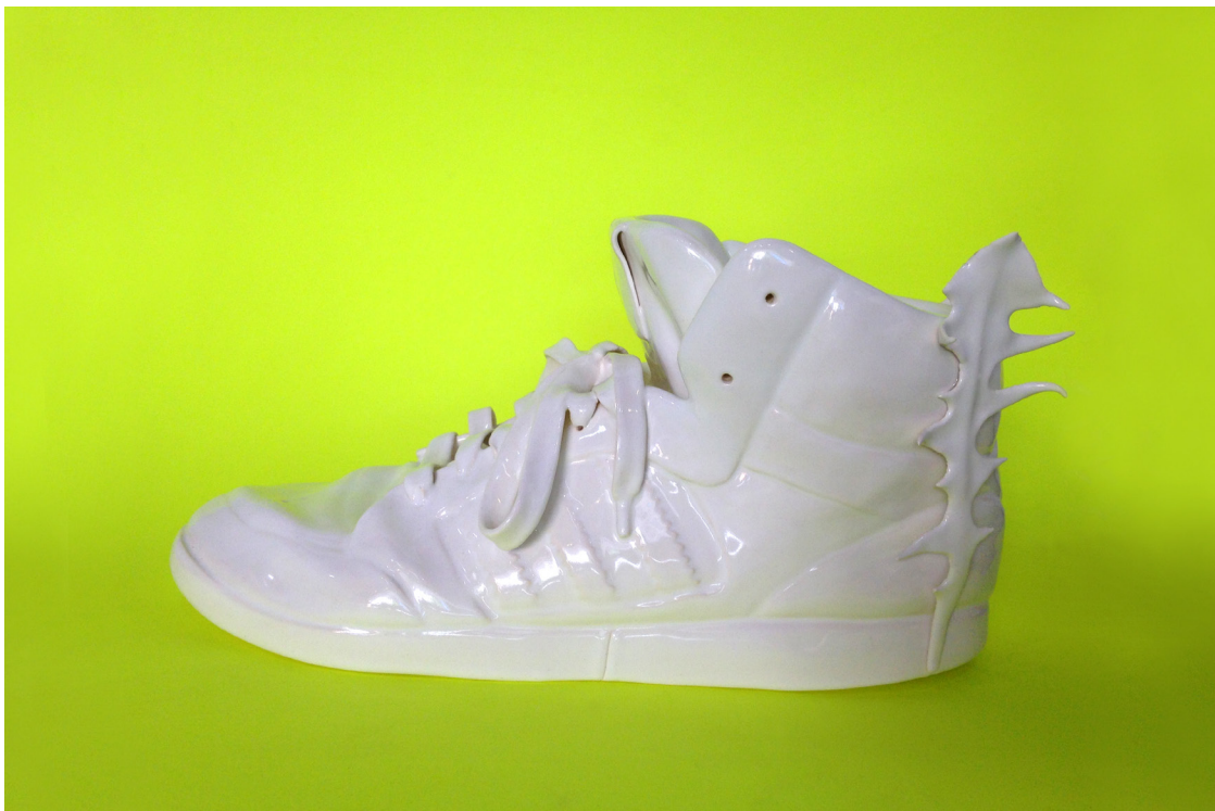
Sunrise / 2015 / Enamelled porcelain / variable dimension

Shoes, plastic bag, dandelions, barbed wire, laces, and an astronaut costume lie in a neon yellow surface. They are like abandoned objects after an ecological disaster.