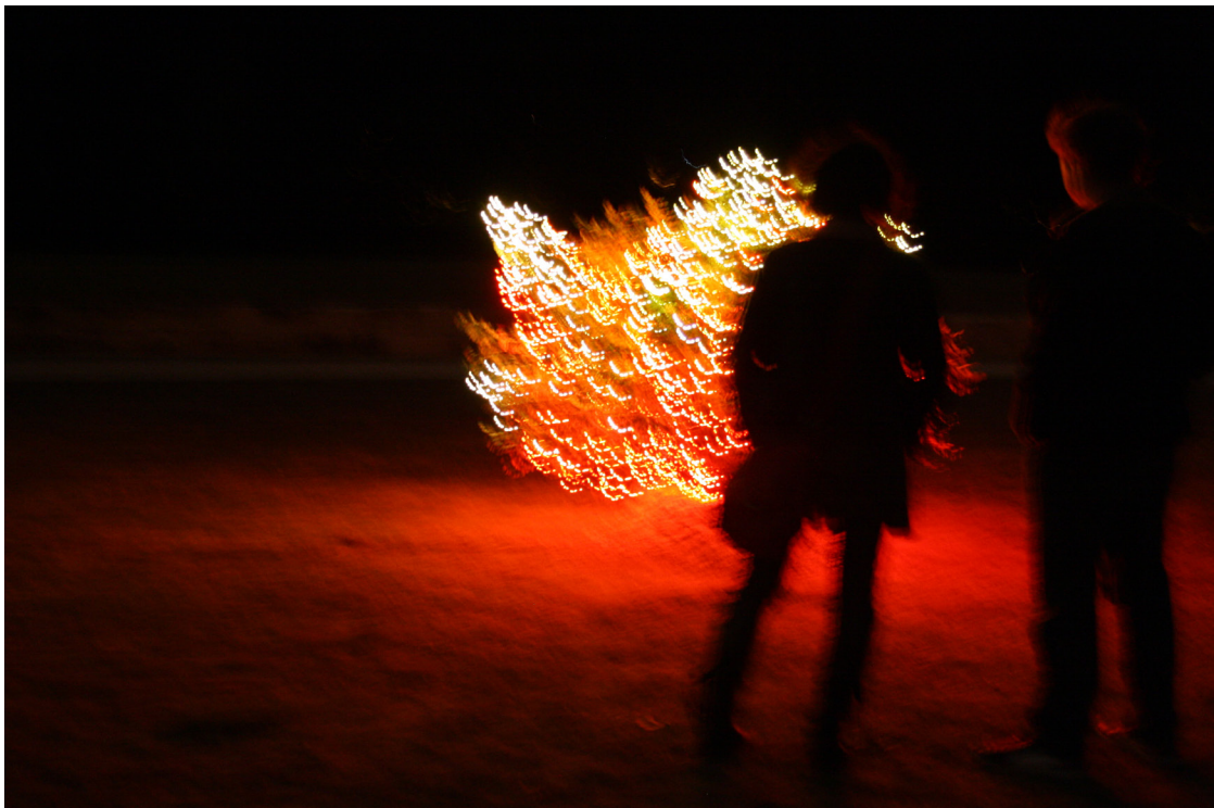
Burning bush / 2009 / Bush + Aluminium structure + LED / blinking bright garlands (yellow orange red) / 200 x 180 x 170 cm

A burning bush in the monastic square of the Maubuisson Abbey on the night of the 'Nuit Blanche'. A miracle is an event; today's art events are miracles of technology. The magical, festive, immediate effect created by winking fairy lights conjures up our sometimes thoughtless fascination for the latest scientific or technological developments. What is this mutating bush made of? What wood is this that never burns away?